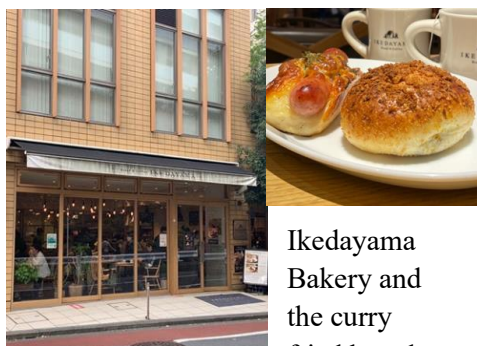
Ikedayama Bakery and the curry fried bread

The Ikedayama bakery , which is located between Takanawadai station and Gotanda station, is a popular teatime spot among the