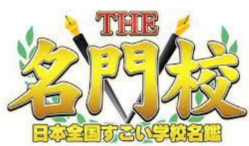
THE Meimon-ko, a TV program

THE Meimon-ko, a television documentary to find out the "unknown side" of schools, finally came to Shoei. Since Shoei hadn't allowed TV cameras for over 20 years, everyone including teachers, students, and parents were very surprised. The TV show introduced the allure of our daily lives and our school event, Co-Learners' Day. The show mainly focused on one student, Miss S,