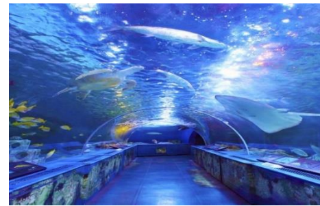
Shinagawa Aquarium

(大森海浜駅). There, you’ll see many species of fish and sea mammals, exhibited in many unique ways. Shinagawa aquarium has many unique shows, including the dolphin show, the seal show, and the Underwater show. This underwater show takes place in the Tunnel tank, where we can see fish and a diver in the tunnel tank. Under the dolphin stadium, there is a transparent window where you can see dolphins underwater. As you cannot see dolphins underwater from the stadium, it is one of the