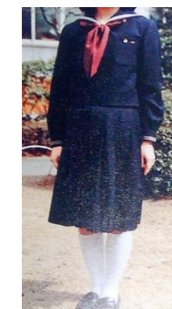
Our school uniform in the past

there weren't many changes, and it was a sailor type of uniform. Midsummer dress was added as a new uniform in 1973. During this time of age many girls-only schools used sailor uniform for their school uniform; it was becoming a national uniform. So, on the 100th anniversary the principal decided to form a new uniform which is what we wear right now. On the 100th anniversary ceremony, new