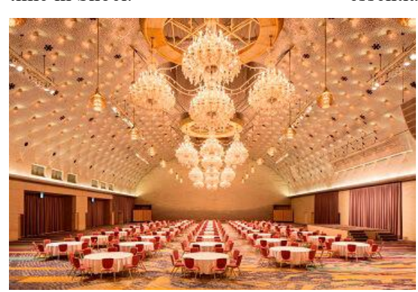
The Hall of Hiten

Only a seven-minute walk from Shoei, stands a gorgeous hotel known as the Takanawa Prince Hotel. Famous for its various wedding venues, the hotel even welcomed actresses for their weddings. Its motto is "Find Peace and Luxury in Nature", and in the center of the hotel surrounded by its buildings, a beautiful Japanese Garden can be seen. This hotel is one of the many Prince Hotels all over Japan. Shoei's close relationship with the Prince Hotel allows students to enjoy its facilities during their time in Shoei.